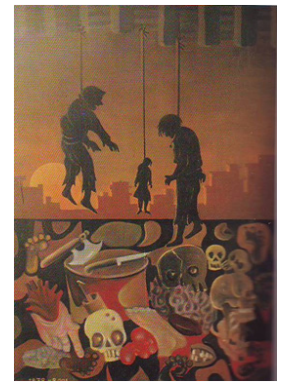
Figure 5: The War Consequence; Oil Paint by Ostad Shabnam