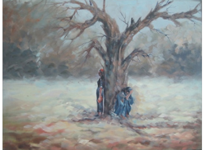
Figure 9: Oil Painting by Anzorgar, Anzorgar Gallery Abdul Wase Rahro Omarzad