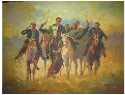
Figure 16 Oil Painting by Hamdard, Gallery