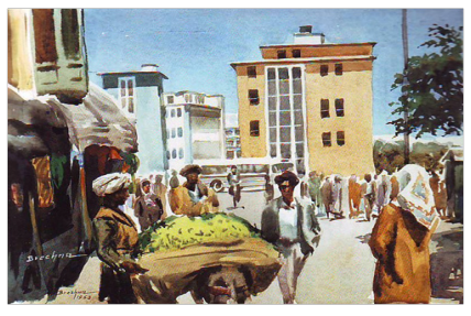
Figure 3: Kabul Public Garden, watercolor by Abdul Ghafoor Breshna

Breshna worked in the realism style and was inspired by the motives of his community.