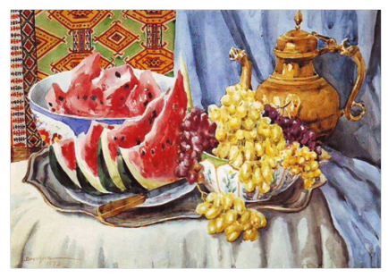
Figure 2: Inanimate Nature Painting with Water Color by Abdul Ghafoor Breshna

Breshna worked in the realism style and was inspired by the motives of his community.