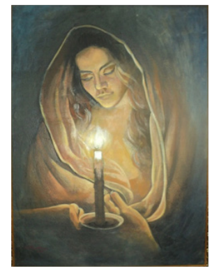
Figure 14 Broken Mirror, Oil Painting by

Figure 13: Afghan Girl, Oil Painting by Miran