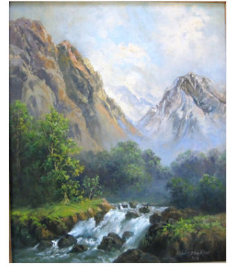
Figure 7: Snow Landscape, Oil Painting by Zhakfar, Zhakfar Gallery