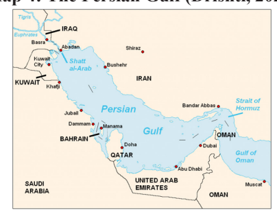
Map 4: The Persian Gulf (Drishti, 2020)