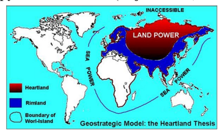
Map 2: Mackinder's Heartland and Spykman's Rimalnd (Rajasimman, 2019)

The importance of the theories of geopoliticians such as Mackinder, Spykman, Maing, Hoffro Mahan in the political and military developments of the Twentieth Century, and the formation of the First and Second World Wars over the seizure of power and wealth led to the two crucial issues geopolitics and geostrategy.