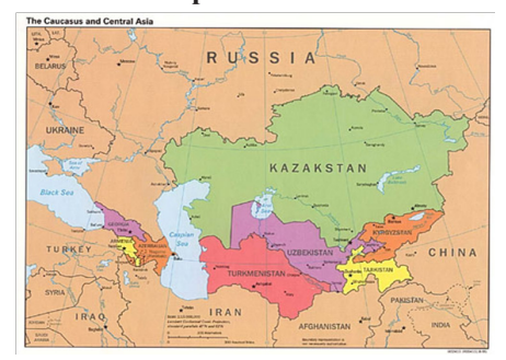
Map 3: Central Asia

This region has received more attention since the early 1990s and the formation of emerging countries from the former Soviet republics. The region's energy resources are significant, and its location is strategically important. Located at the