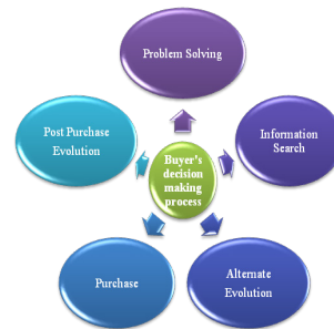
Figure 3 Buyer's Decision-Making Process

The buyer's black box is prepared by the seller to give it to the consumer. It also depends upon the environment which it is dealt with. The black box comprises of two sub constituents. They are buyer's characteristics and the buyer's decision process. The characteristic features of a buyer can be understood by observing the consumer's beliefs, attitudes, values, knowledge, motives, perceptions, and lifestyle. The buyer's decision-making process consists of five major steps. Every buyer's decision-making process exclusively be influenced by his/her characteristics. The buyer's decision-making process shown below.