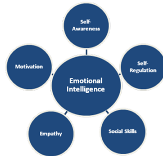
Figure 1: Constructs of Emotional Intelligence

The concept of emotional intelligence has been defined by different models; ability model, mixed model and trait model (Tyagi and Goutam, 2017). According to the ability model, emotional intelligence is defined as the ability to observe emotion, integrate emotion to check thought, understand emotion and regulate emotion to promote personal growth. According to the mixed model which was developed by Daniel Goleman, emotional intelligence includes a group of a wide range of competencies and skills that drive the performance of the individuals. According to Cherry (2018), “emotional intelligence refers to an individual’s capacity to understand and manage emotions”. It also includes the chief five components. This mixed model of emotional intelligence is based on the following five constructs; self-awareness, self-regulation, social skill, empathy, and motivation.