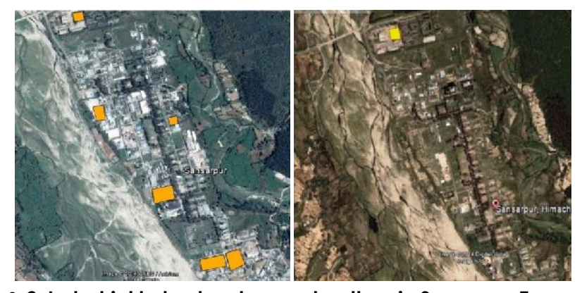
Plate No. 1 & 2: Industrial hubs development pattern in Sansarpur Terrace Industrial Area (Kangra District) in year 2002 & 2014

Growth centre Sansarpur Terrace has been developed on 6, 60,000 square meters with 389 plots and 30 sheds have been developed. 120 units have been set up with an investment of Rs.85.92 Cr, and have provided employment to 1454 workers, out of which 85 per cent of the employed workers are Bonafied residents of the Himachal Pradesh. Major industries are Pharmaceutical, Textiles, Paper Product, Steel Product, Chemical, and Agglomerated Stone, Railway parts, Foot bears and Agro based. 64 projects are under pipeline with proposed investment of `53.60 Crores.