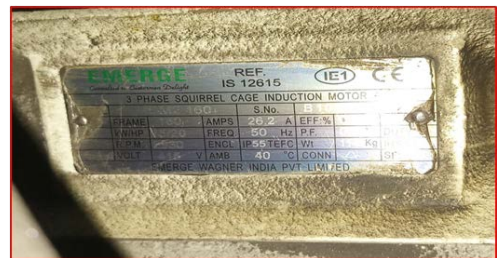
Name Plate Details of New EE Motor – 20 HP Emerge Wagner Make