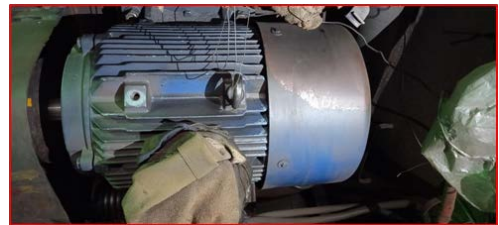
New Motor – 20HP Bharat Bijilee make