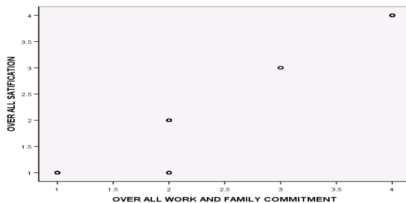
Chart 1: Pearson Correlation

** Correlation is significant at the 0.01 level (2-tailed)