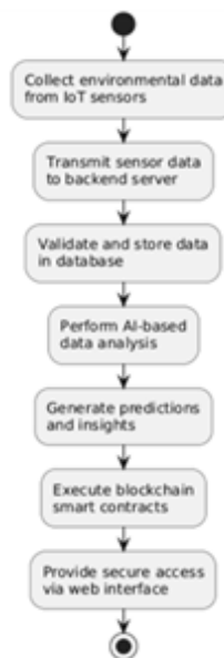
Fig. 1 AI-Driven IoT-Blockchain Smart Agriculture Workflow

The complete workflow has been implemented and tested in a real-time environment to validate system feasibility and performance.