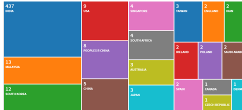
Figure 2: Country wise Collaboration

The above figure 2 shows that the faculty of TCE is collaborating Globally for the research. The above figure is retrieved from Web of Science on 11.10.2019 for TCE with a limit to 2014-2018 publications.