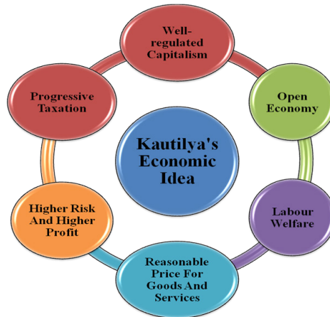
Figure 4.1 Kautilya's Economic Ideas

No doubt that, Kautilya's Arthashastra guides on the productive resource management, progressive taxation, efficient tax imposition, surplus or balanced budget and also highlights economically-oriented political activities in a state. He has explained so many economic ideas but the present study has taken few of them for the description.