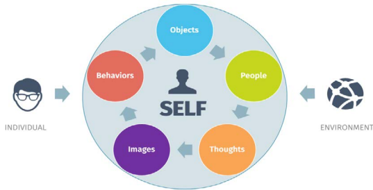
Figure 1: Carl Rogers concept of self-actualisation

Rogers distinguishes between authentic and ideal self. The ideal self is what one desires to be, whereas the authentic self is who they are. People's ideal selves do not match reality (Main). The above statement entails cultivating self-awareness, embracing oneself, and establishing an authentic connection with one's experiences and emotions.