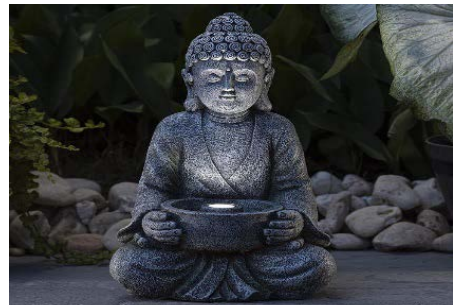
Figure 1: Zen Buddhism https://medium.com/@mckinneydeco/r/en-garden-buddha-statu-

Eastern philosophies, such as mindfulness and Zen Buddhism, have a rich tradition of prioritising self-realisation through internal awareness and meditation. Mindfulness originates from Buddhist practises and entails being fully present in the present moment, impartially observing thoughts and sensations (Xiao et al.). Self-reflection enhances self-awareness and promotes self-realisation by revealing one's authentic essence. Zen Buddhism emphasises the practice of meditation as a means of achieving direct and experiential self-realisation (Swann). Zen is a Buddhist school that places a premium on meditation and intuition (Decor). It encourages individuals to go beyond conceptual thinking and encounter their authentic nature, commonly known as 'Satori' or an instance of enlightenment.