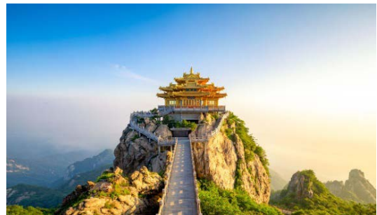
Figure 1: Taoism https://education.nationalgeographic.org/resource/taoism/

Vedanta is a Hindu philosophical tradition that is closely associated with the idea of self-realisation. Advaita Vedanta teaches the identity between the true self (Atman) and the ultimate reality (Brahman), emphasising that recognising this unity is essential for self-realisation (Wrenn). Self-realisation in Vedanta entails a profound comprehension of the self, the dissolution of ego, and the direct encounter with the divine unity.