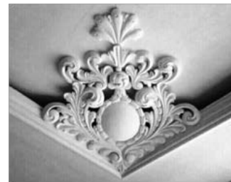
Figure 17 Prefab Plastering/Molding, House Ceiling, Contemporary age, Herat