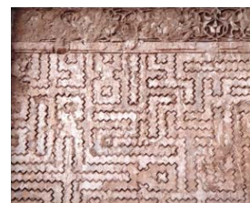
Figure 3 Kufi Muaqli Denticulated Inscription, plastering of Ghowri Era, Maqsurah Porch of Herat great Masjid- Afghanistan