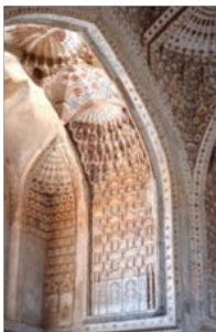
Figure 6 Plaster Cornicing of Timori Era, Roof of Goharshad Begum’s Mausoleum