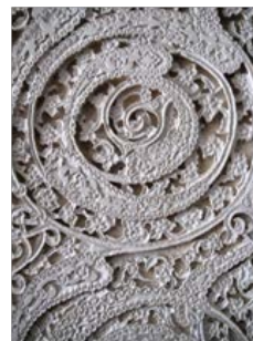
Figure 14 Plastering on Dry and Hard Plaster, Aslimi Patterns in Two Ways, Contemporary Age, Altar of Herat Great Masjid- Afghanistan