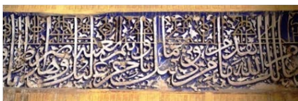
Figure 7 Plastering Inscription, Fatah Surah, Thuluth Script, inside of south porch of Herat great Masjid-Afghanistan