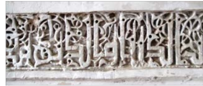
Figure 1 Decorative Kufi Inscription, Plaster of Ghowr Era, Maqsurah Porch of Herat great Masjid- Afghanistan

often the date of the construction of the mosque was written in it (Ghawas).