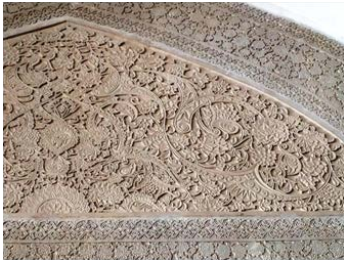
Figure 15 Plastering on Dry and Hard Plaster, Contemporary Age, Above of Herat Great Masjid Altar

The decorative elements used in the winter altar of Herat Great Mosque, there are used Aslami patterns like torpedoes and half-torpedoes, petals, cams and leaves in different shapes and sizes in addition to geometric patterns.