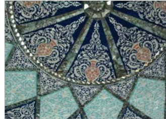
Figure 16 Plastering on Damp Plaster, Aslami Patterns of Ceiling Vault of Military Museum (Manzar Jihad) Contemporary Age, Herat-Afghanistan

the ceilings and walls of rooms, community halls, restaurants and home kitchens in a new way called “Ravizbandi” (a type of cornicing). take This method can be implemented at a lower cost than the previously mentioned plastering, and it is more common today, and by embedding hidden light next to the plaster tools, it makes the plaster decorations stand out and more beautiful (Picture 18).