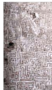
Figure 2 Inscription of Muaqli Kufi, Plastering of Kufi Era, Herat great Masjid- Afghanistan

The decorative Kufic inscription can also be seen in this building, where decorative elements is used between plastered Kufic inscription on a rope in a shape of spiral arch such as a torpedo, a crown and a half crown.