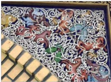
Figure 11 Plastering on Dry and Hard Plaster, Contemporary Age, Waq, Combination of Aslimi Patterns with Animals, Inside of Herat Provincial Hall, Afghanistan

The plaster motifs inside the Herat house have been worked with different methods and techniques, some motifs have been painted around the elements of the pattern with black paint after carving patterns, and some have been framed without painting. And some parts had been painted with gold, silver and azure colors.