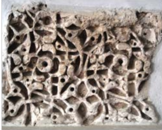
Figure 4 Aslami Motifs, Plastering of Ghowri Era, Maqsurah Porch of Herat great Masjid-Afghanistan

In the plastered decorations of Ghowr era, Aslami motifs are used next to Kufic inscriptions or separately from Kufic lines in which are arranged together with elements like: cam, crown and torpedoes, in some parts with slime movement and in some parts without slime movement (pictures 4 and 5).