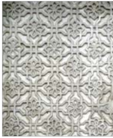
Figure 9 Geometric Patterns, Plastering of Contemporary Age, Herat Provincial Hall, Afghanistan

designs. The above-mentioned decorations, colored and also non-color (white), are used on the top of the gates and next to the windows for decoration (pictures 9-11).