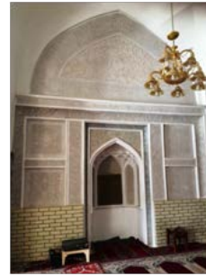
Figure 12 Plastering of Contemporary Age, The Winter Altar of Herat Great Masjid- Afghanistan

Plastering of this altar has been done in different ways. For example, some of the motifs were carved background first, and the motifs were written in the next step. Some parts of the stucco, its background was carved and later it was framed like Haft Qalam stone; That is, on the elements and ropes of the pattern, instead of penning, was created carves and protrusions to beautify patterns. And some plasterwork of the altar is also decorated with color (pictures 13 and 15).