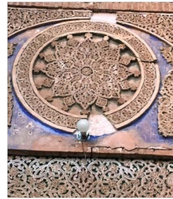
Figure 8 Plastering of Amir Doost Mohammad Khan Kingdom Age, Entrance Porch of Khawaja Abdullah Ansari’s Mausoleum, Herat-Afghanistan