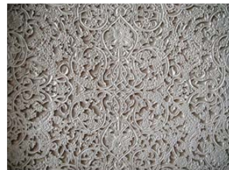
Figure 13 Plastering on Dry and Hard Plaster, Contemporary Age, Altar of Herat Great Masjid