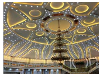
Figure 18 Ravizbandi Plastering, Ceiling of Qasr Royaha Hall, Contemporary age, Herat