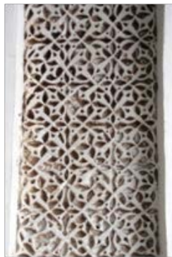
Figure 5 Plastering Decoration of Ghowri Era, Maqsurah Porch of Herat great Masjid-Afghanistan

Chisht monastery and school, which was built in the 12th century by the order of Sultan Ghiasuddin Ghowri, two tall domes of the complex have just survived. Chesht Monastery looks in square shape and highly elevated. Inside-around one of these buildings, there is a common Kufic inscription of Ghowr era in which is plastered and decorated with flowers. The context of this inscription is as follows: There is no god, He is the Holy King, peace, the believer, the dominant, the mighty, the arrogant [He commanded] that this be renewed for the buildings during the days of the state, the great king Al-Muwayd, Al-Muzaffar Al-Mansur, the just scholar, the sun of the world and religion