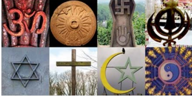
Figure (From left to right):