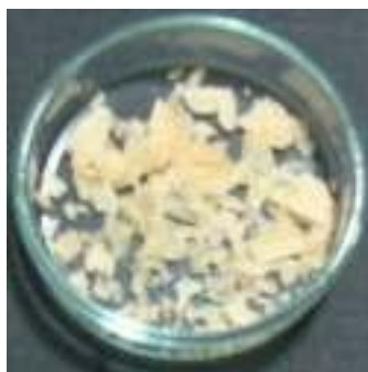
Chitosan flakes obtained from shrimp shells after processing in the lab scale

The bleached product was then soaked in 40 percent sodium hydroxide and heated at 60°C for 3-4 h. The excess alkali was removed by repeated washing and sun dried for 2-3 days to get the flakes.